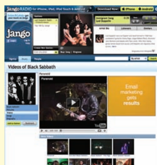
Jango's "guaranteed airplay" is a sure bet.

Jango ( jango.com ) is an online personalized radio site (similar to Pandora) that has a feature called